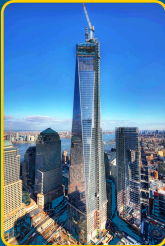
WTC In Progress