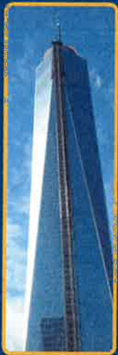
WTC In Progress January 2014

The Steamfitters' Industry Fund Office 5 Penn Plaza 21st Floor New York, NY 10001-1887 Telephone: (212) 465-8888 E-mail: FundOffice@steamny.com Website: www.steamfitters.com